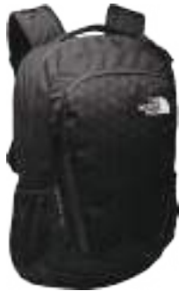
TNF BLACK/TNF WHITE