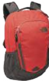
RAGE RED/ ASPHALT GREY