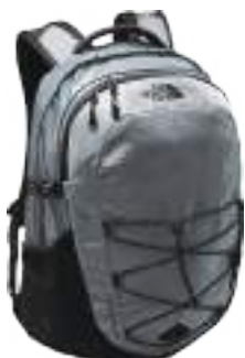
ZINC GREY HEATHER/ TNF BLACK