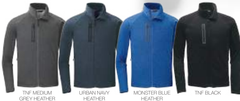
TNF MEDIUM GREY HEATHER