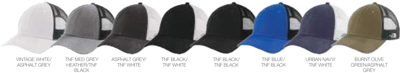
VINTAGE WHITE/ ASPHALT GREY