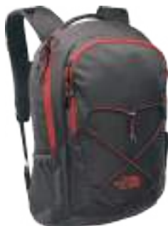
TNF DARK GREY HEATHER/CARDINAL RED