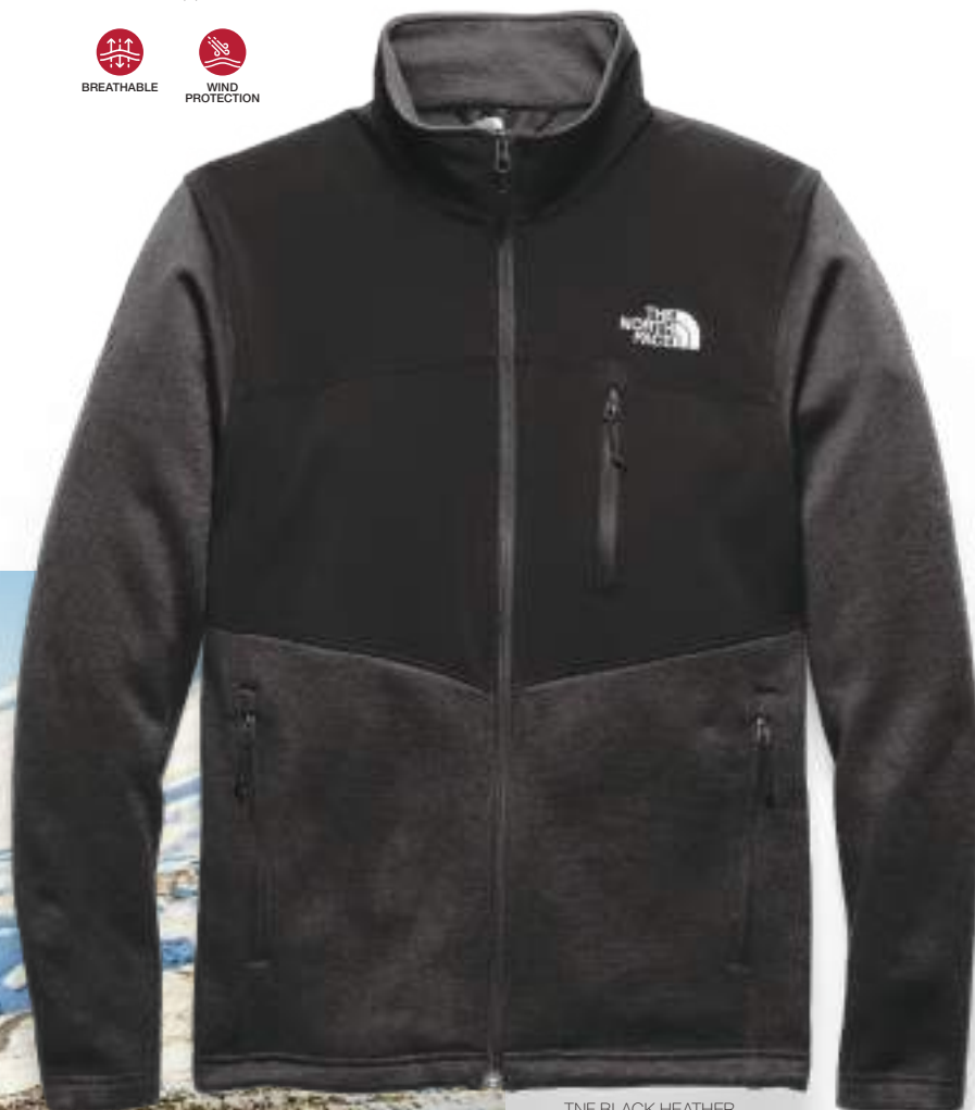
TNF BLACK HEATHER