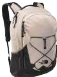
RAINY DAY IVORY DARK HEATHER/TNF BLACK