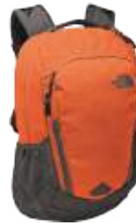
TIBETAN ORANGE/ ASPHALT GREY