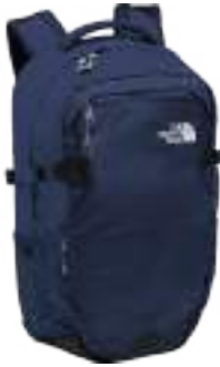
COSMIC BLUE/ ASPHALT GREY