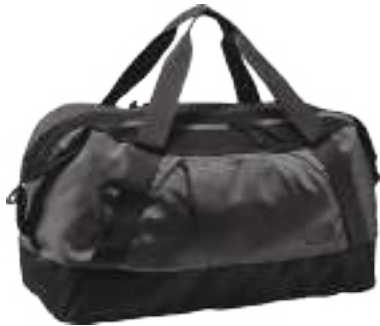
ASPHALT GREY/TNF BLACK