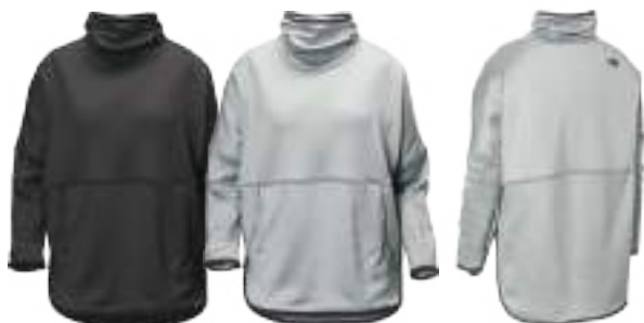
TNF BLACK HEATHER