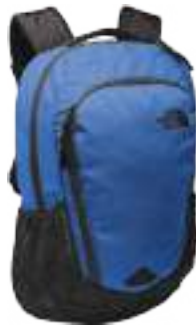
MONSTER BLUE/ TNF BLACK