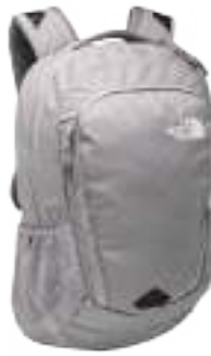
MID GREY DARK HEATHER/MID GREY