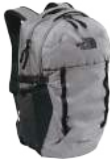
MID GREY DARK HEATHER/TNF BLACK