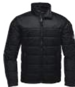
HEATSEEKER™ INSULATED LINER JACKET