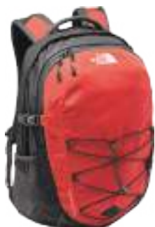
TNF RED/ASPHALT GREY