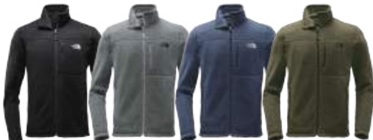
TNF BLACK HEATHER