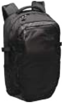
TNF BLACK HEATHER