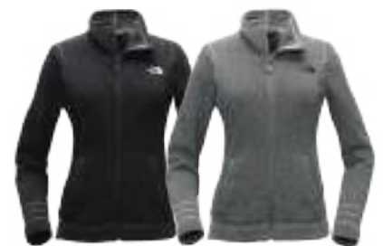
TNF BLACK HEATHER