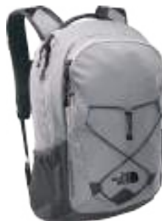
MID GREY/ASPALT GREY