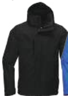
TNF BLACK/ TNF BLACK