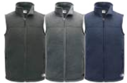
TNF BLACK HEATHER