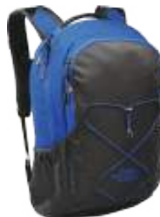
MONSTER BLUE/ ASPALT GREY