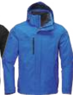
MONSTER BLUE/ TNF BLACK